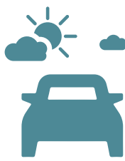
2 Cars Outdoor Garage