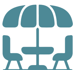
Outdoor Living Room under roof