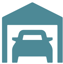
1 Car Indoor Garage (with possibility of gym)