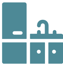
Kitchen with island